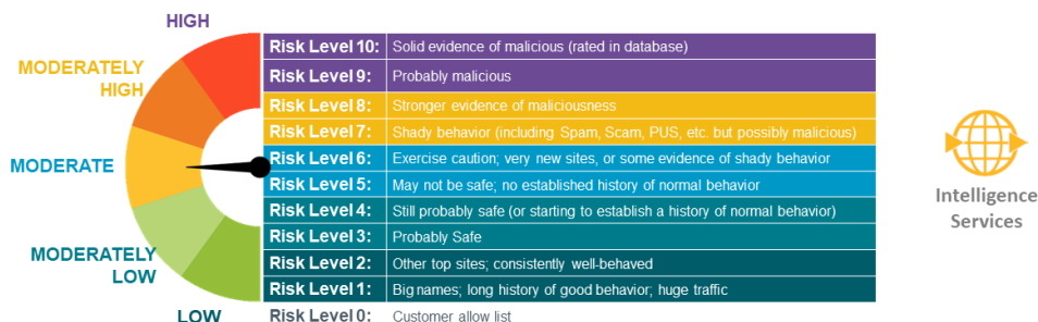
Figure 1: Risk Levels

High Risk Isolation is included in Symantec SWG. This allows high-risk websites (risk level 5 and above) to be isolated, helping organizations significantly reduce web-based risk. In addition to High Risk Isolation, Symantec offers an advanced cloud-delivered Secure Web Gateway and leading on-premises Secure Web Gateway deployment—both of which can operate seamlessly together with a unified management, reporting, and policy-control interface. It also includes Threat Intelligence, SSL inspection, content analysis, isolation, and sandboxing, solutions that help customers understand, prioritize, store and protect critical data.