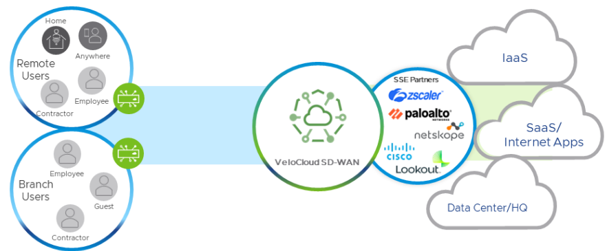
Figure 1: VeloCloud SD-WAN and our SSE Partners deliver comprehensive SASE solution

Benefits of a dual-vendor SSE solution from VMware and our SSE partners include: