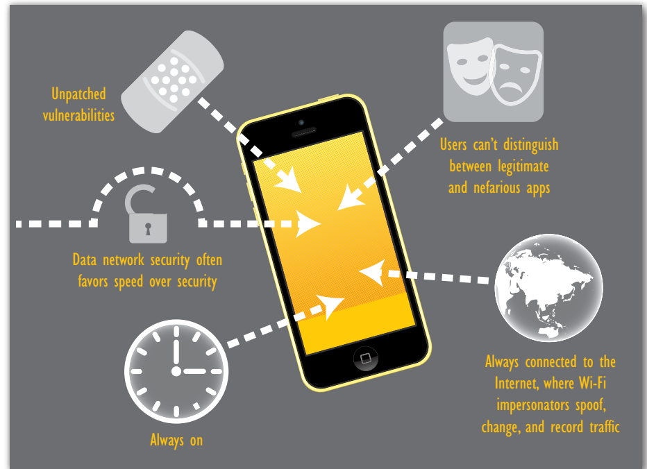
Figure 1. Mobile Device Risks

First and foremost, they are always on and always connected (or seeking a path) to the Internet. Without user intervention, they connect to networks that match the characteristics of previously known networks, which means that if someone can impersonate a known network, the device will connect to it. Figure 1 shows the variety of risks posed by mobile devices.