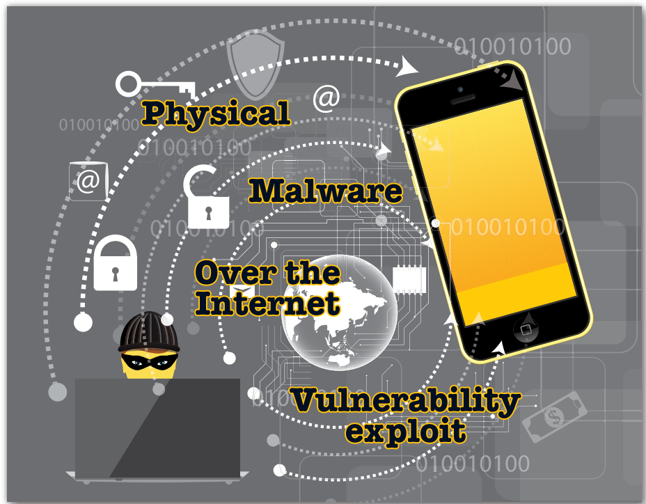
Figure 2. Mobile Device Attack Vectors

Mobile devices are susceptible to various types of attacks. These attacks can be physical, over the network, a vulnerability exploit or via malware. Let's look at some common scenarios and possible mitigation methods for those attacks. Figure 2 represents the various attack vectors for mobile devices.