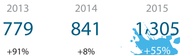
2015 Risk Ratio of Spear-Phishing Attacks by Organization Size

Cyber attackers are playing the long game against large companies, but all businesses of all sizes are vulnerable to targeted attacks. In fact, the number of spear-phishing campaigns targeting employees increased 55% in 2015.