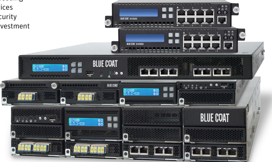
Figure 4 - The Symantec SSL Visibility family of appliances

For more information on how Symantec can assist you in managing your encrypted traffic in support of compliance mandates, please contact us or your local Symantec authorized Channel Partner today.