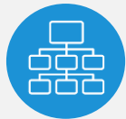
Technical Deep-Dive Sessions