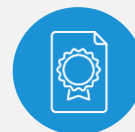
CA Product Certifications and Automation Training