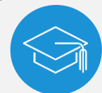
Continuing Education Credits