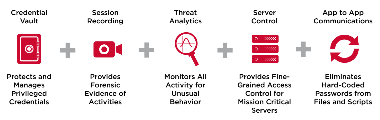
Figure 1: Five Key Capabilities of Symantec Privileged Access Management

The solution also vaults and rotates the credentials for privileged accounts, including the passwords. Additionally, when you deploy the threat analytics module to the solution, you can detect unusual, out-of-pattern activities. You can then trigger automatic mitigations of these activities if the behavior is deemed too risky. However, even organizations that have effective privileged access management solutions in place often face challenges in governing privileged user access on a continuous basis.