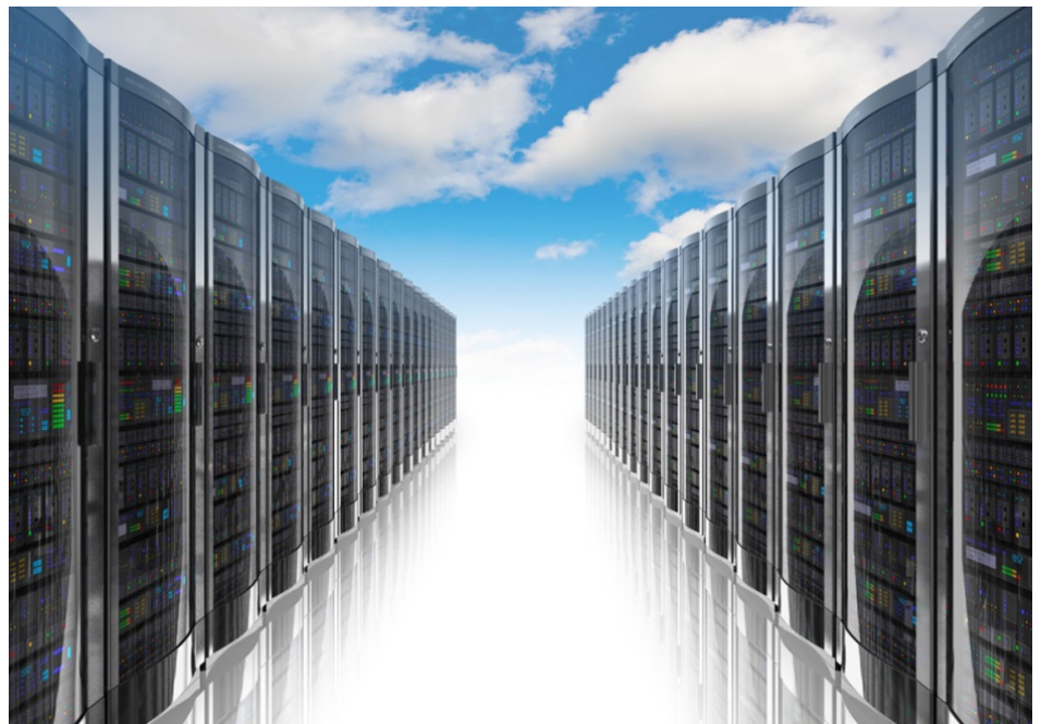
Figure 1: Cloud-scale Datacenters

In traditional network monitoring, an application polls the host CPU to gather aggregated telemetry every few seconds or minutes which doesn't scale well in next generation networks. In-band telemetry enables packet-level telemetry by having key details related to packet processing added to the dataplane packets without consuming any host CPU resources.