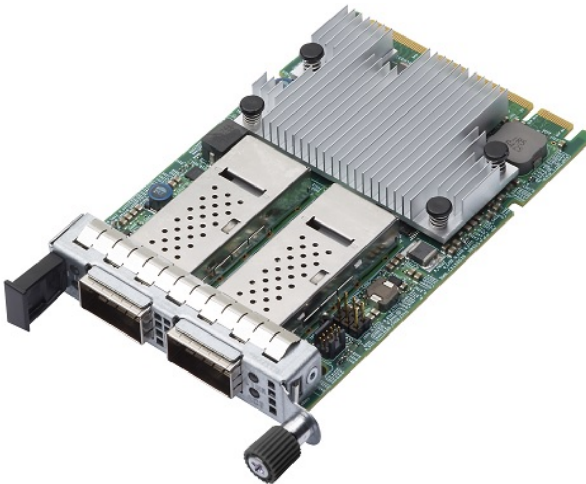
Figure 1: BCM957508-N2100G OCP 3.0 SFF Network Adapter

NOTE: Figure 1 shows the pull-tab bracket installed by default. The surface markings of the component may not reflect the product upon receipt. Broadcom reserves the right to change any component on the printed circuit board with the same functionality.