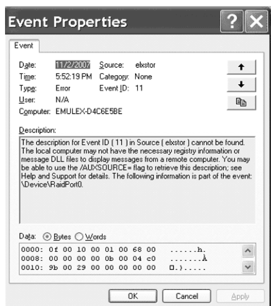
Figure 2: Event Properties

byte 0x10 = 9b, byte 0x11 = 00, byte 0x12 = 29, and byte 0x13 = 00