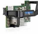
HP FlexFabric 10Gb 2-port 534FLB CNA