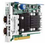
HP FlexFabric 10GBASE-T 2-port 533FLR-T Adapter